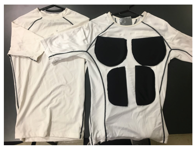
FIGURE 1. Visual representation of the weighted compression garment inner and outer shirts plus inserts. With all pockets loaded with two inserts, the final mass of the weighted compression garment was 6.8 kg.

After the strides, investigative team members helped participants remove the weighted compression garments before runners walked ~200 m and rested for 10 min before their time trials, similar to the protocol used