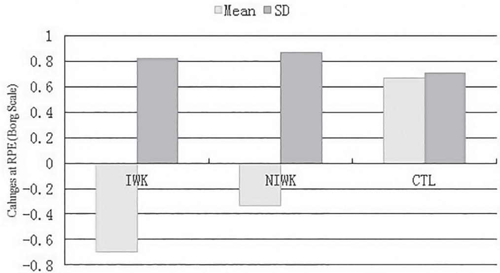
FIGURE 1 Rate of received exertion (pre to post) between groups

The result of statistical analysis has been shown there was a significant differences of rate of perceive exertion at the p < .05 level for the three groups [ F(2, 25) = 7.243, p = 0.003 ]. Post hoc comparison using by bonferroni indicated that the score of RPE at control group was significantly different that the IWK and NIWK group.