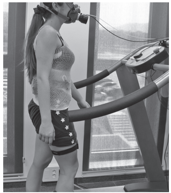
FIGURE 1. Start of the test. Humon Hex® placed on right thigh

First, cardiovascular examinations at rest were performed with the athletes in supine decubitus, assessing cardiac auscultation, blood pressure, and electrocardiogram (EKG). The electrodes were maintained to collect the EKG trace throughout the stress test. Heart rate (HR) and EKG recording were obtained with a Cube<sup> \circ </sup> cardioline electrocardiograph. Subsequently, a Humon Hex<sup> \circ </sup> device was placed on the thigh of the dominant side, on the vastus lateralis (Figure 1). To display the information of the SmO<sub>2</sub>, exercise time and heart rate (HR), the Humon Hex<sup> \circ </sup> was synchronized with a tablet with the Humon app.